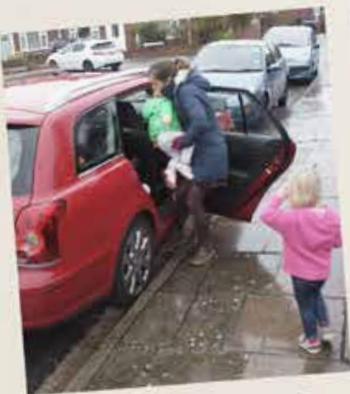
Today the family are going to visit a real farm