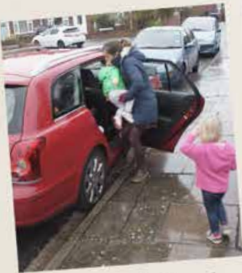
Today the family are going to visit a real farm